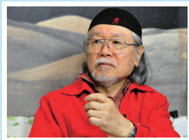
Kitakyushu Manga Museum